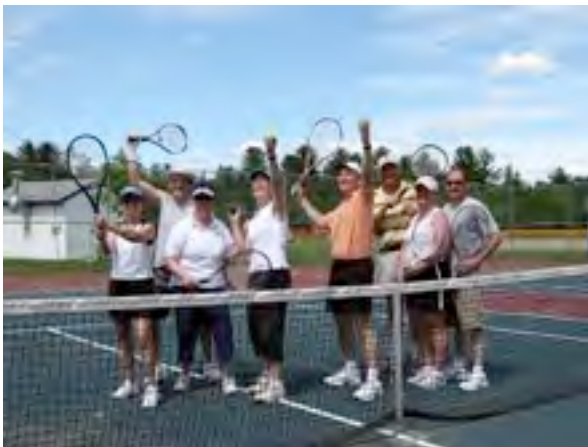
The Competitors: From Left to Right:

Open to all -- tournaments are planned for July 9 th - ladies' doubles, July 10 th - men's doubles and August 21 st - mixed doubles. Tournaments are free - just bring a new can of tennis balls. Don't forget FUN tennis every Tuesday from 4:30 to 6:30PM and Sunday from 2 to 4PM - No cost and no sign up - just show up - everyone will play. Contact Mary Lou at 943 3267 for information or to sign up for the contests.